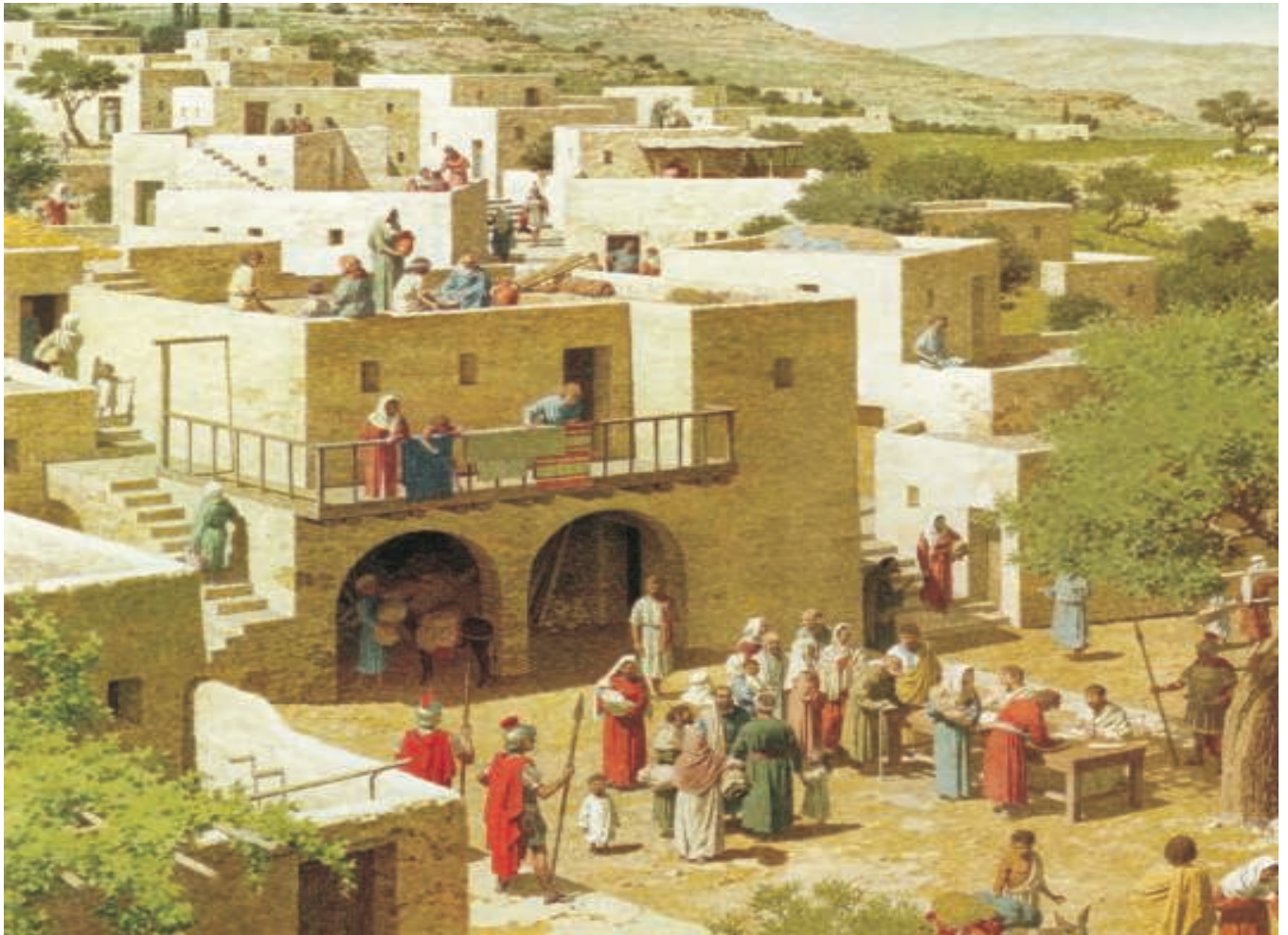
A Town in New Testament Judea